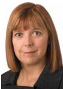
Lord Mayor Gerry Breen

International Women's Day, 8th March, is a global day of celebration where women from all countries and of different political, economic, social, linguistic and ethnic backgrounds can join together to reflect on the struggle for equality over the past century, celebrate the achievements to date and identify the challenges for the future.